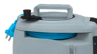
Manual cord winder